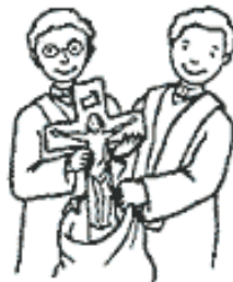
VENERATION OF THE CROSS