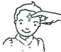
ASH WEDNESDAY HOLY ASHES