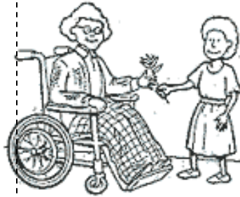
WORKS OF MERCY